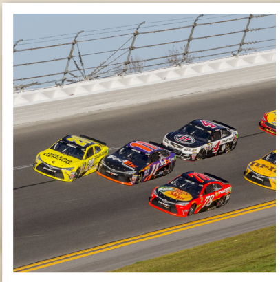
NOW: Since its opening in 1959, the Daytona Beach International Speedway has been home to NASCAR's Daytona 500.