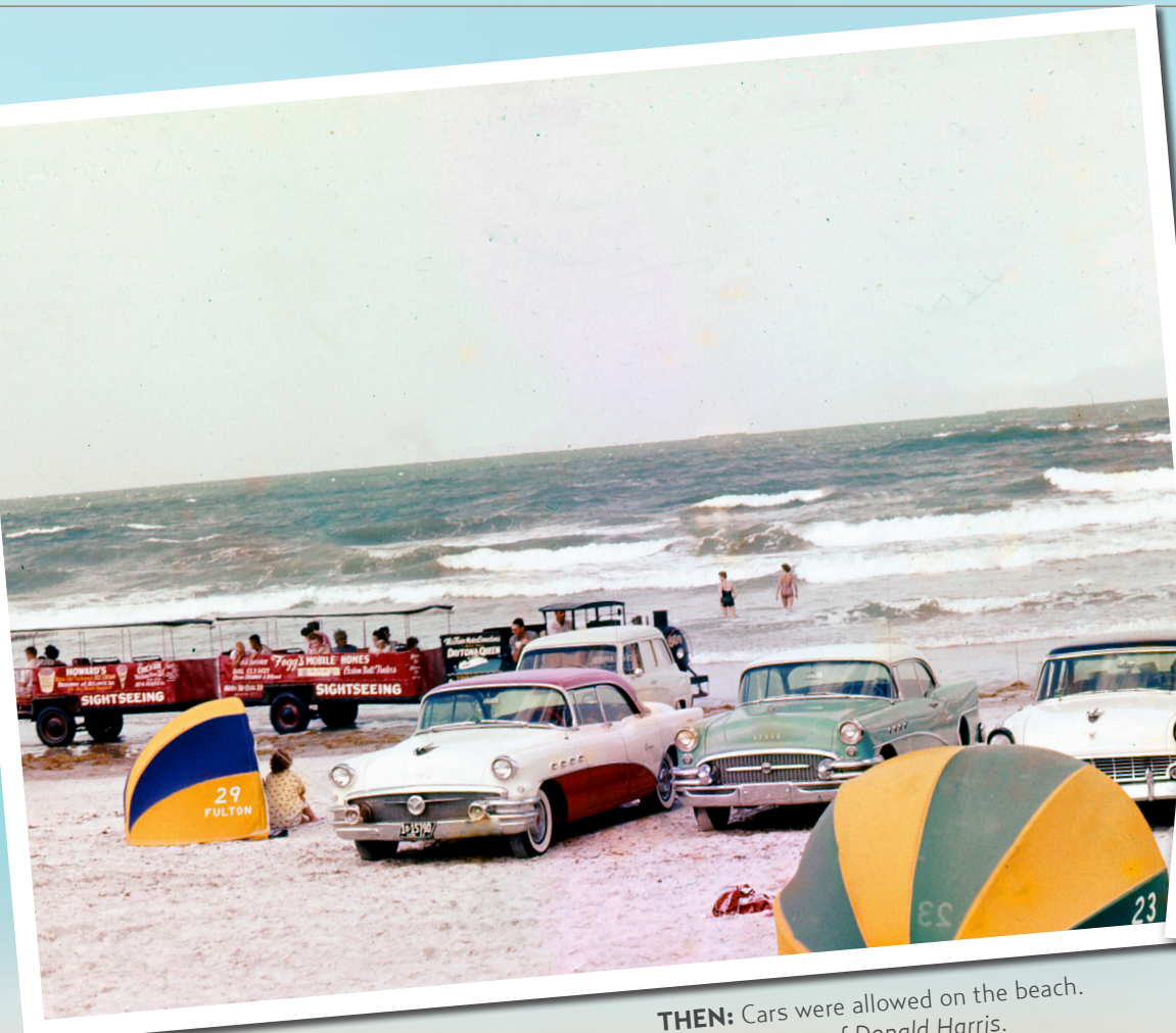
THEN: Cars were allowed on the beach.

A vibrant mecca for living the good life