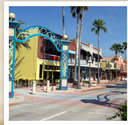
NOW: Daytona Beach's Beach Street as it appears today.