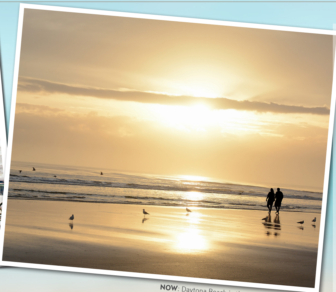
NOW: Daytona Beach is the perfect spot for witnessing the sunrise.

W orld famous Daytona Beach...23 miles of wide beaches; clear, brilliantly hued ocean waters ranging from emerald to azure, foaming waves, and refreshing Atlantic breezes...the stuff of dreams. But there is oh-so-much more!