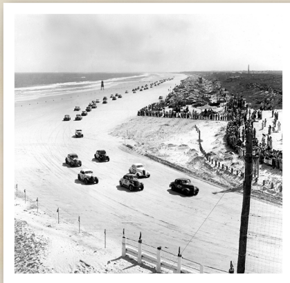
THEN: The Daytona Beach Road Course in the 1930s.