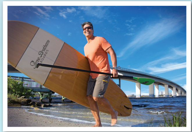
NOW: The South Bridge as it appears today.